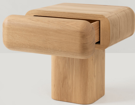
Roll nightstand. Oak