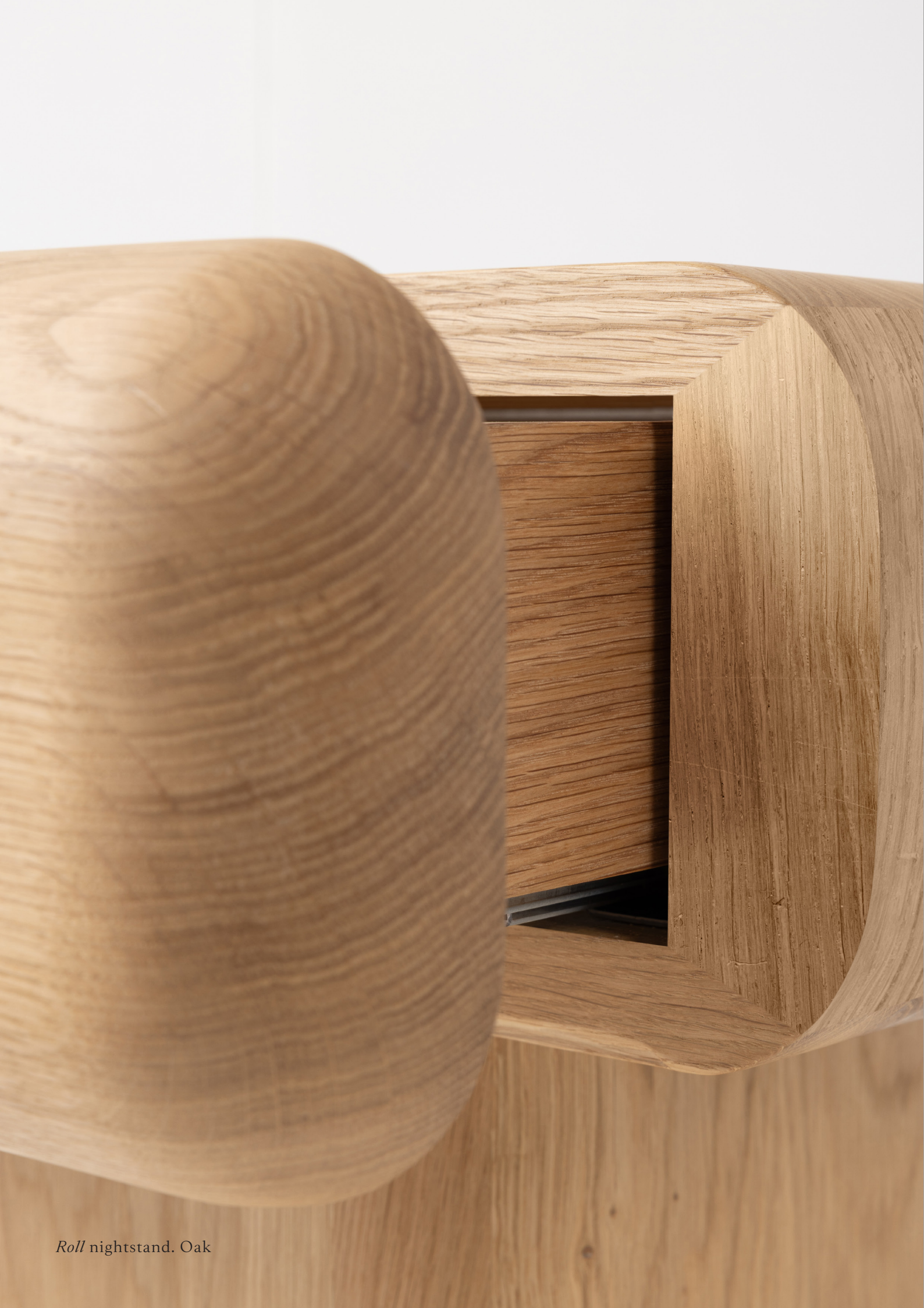
Roll nightstand. Oak