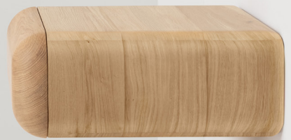
Roll cantilever nightstand. Oak