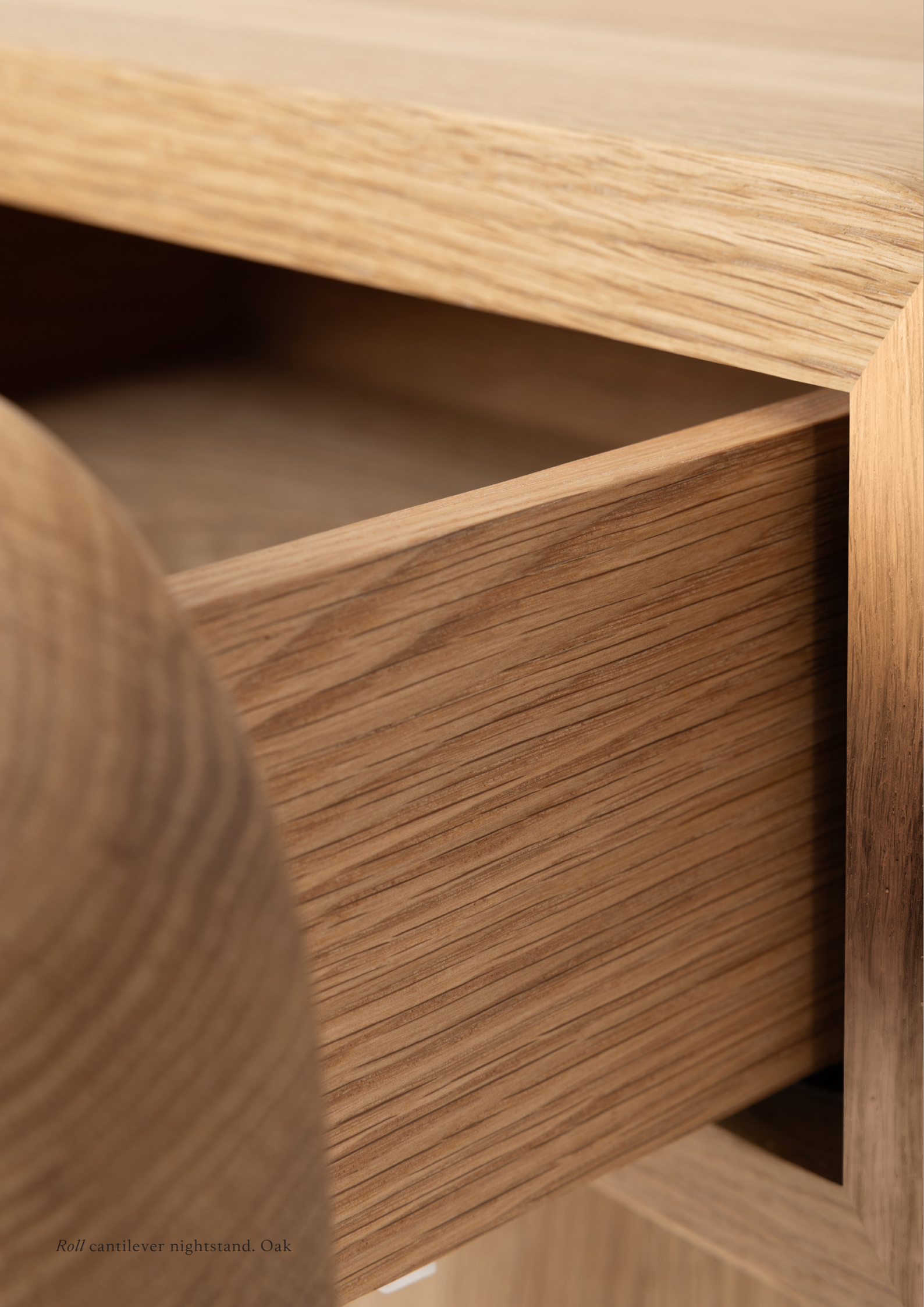
Roll cantilever nightstand. Oak