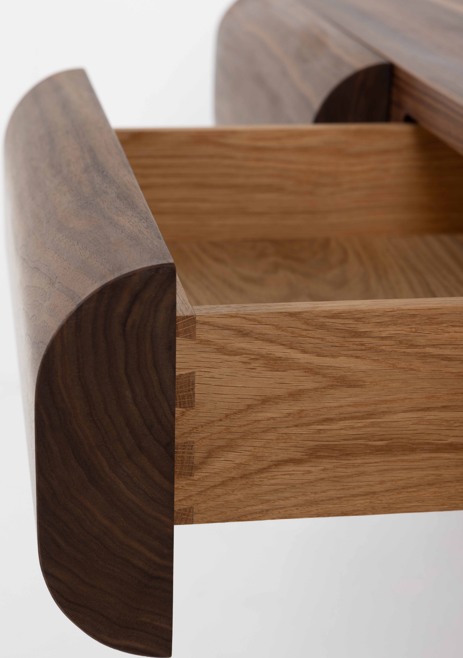
Roll cantilever console. Walnut