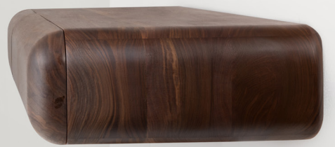
Roll cantilever console. Walnut