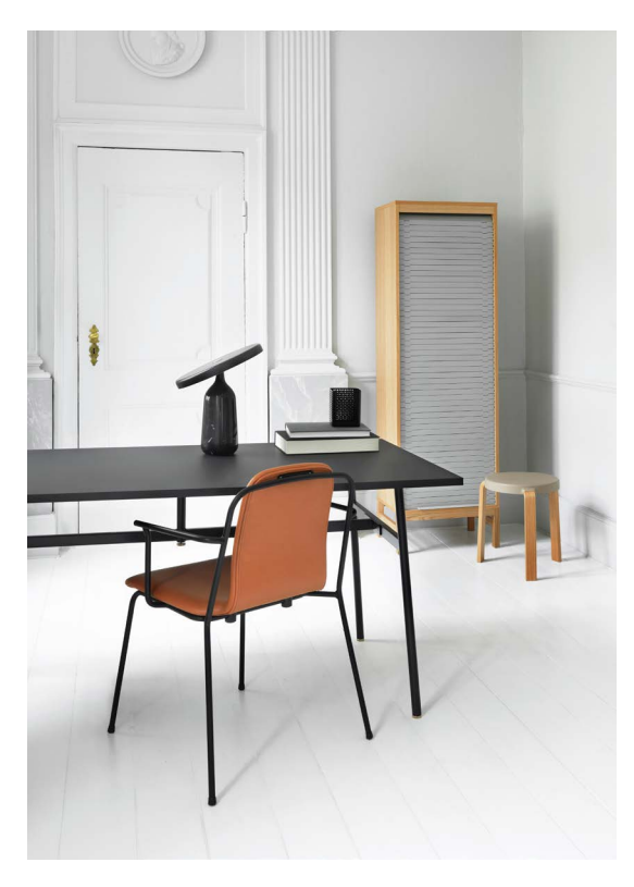
Studio Armchair full upholstery steel