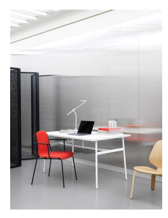
Studio Armchair full upholstery steel