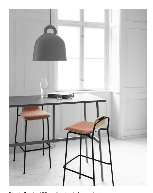
Studio Barstool 75 cm front upholstery steel