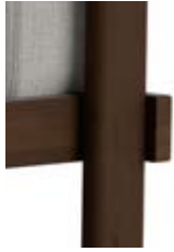
Brown Stained Pine (FSC™ C163461)