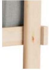
Pine (FSC™ C163461)