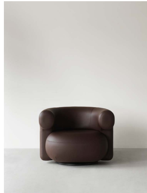
Burra Lounge Chair in Ultra Leather