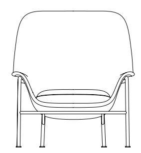
Drape Lounge Chair high steel legs H: 103 x W: 93 x D: 84 x SH: 43 cm