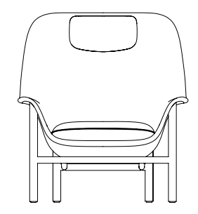
Drape Lounge Chair high w. headrest wood legs Drape Lounge Chair high w. headrest steel legs H: 103 x W: 93 x D: 84 x SH: 43 cm