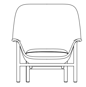
Drape Lounge Chair high wood legs H: 103 x W: 93 x D: 84 x SH: 43 cm