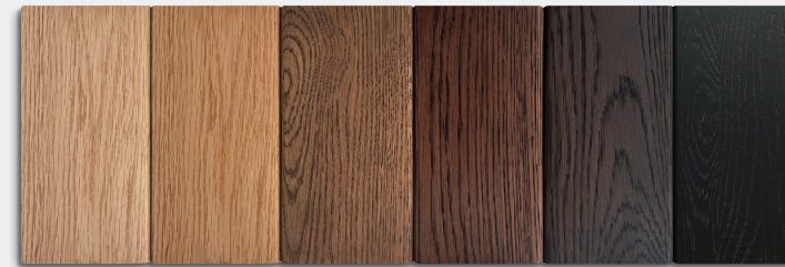
solid oak blond #104 solid oak light #10 solid oak late #42 solid oak espresso #15 solid oak bison #451 solid oak black #181