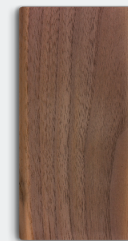
solid american walnut #20